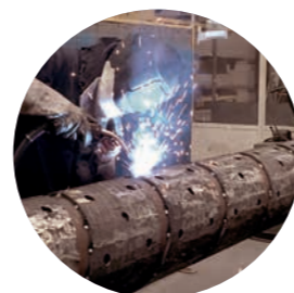
HARD SURFACE WELDING