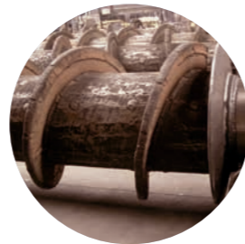
WEAR RESISTANT STEEL